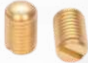
Slotted Grub Screw