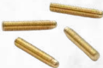
Brass Pointed Screw