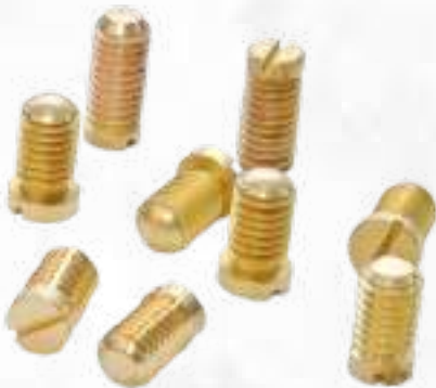
Brass Slotted Screw