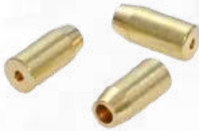
Brass Spacer Bush