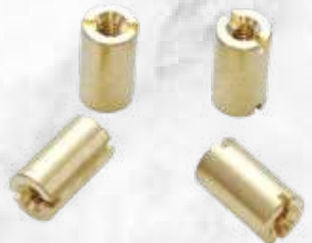
Brass Slotted Spacer