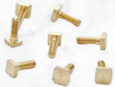
Brass Square Screw