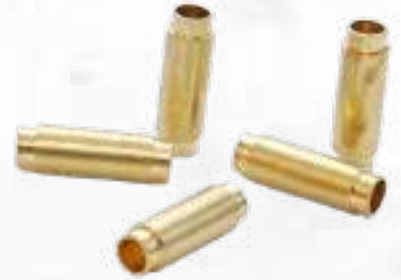
Brass Spacer Spindle