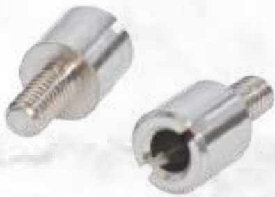
Brass Round Spacer