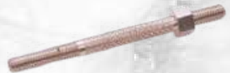
Knurling Long Screw