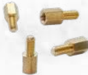
Space Male Female