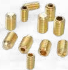
Grub Screw Slotted