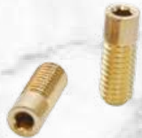
Brass Grub Screw